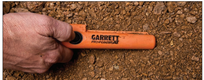
(Above) Fast retune feature quickly tunes out mineralized ground, salt, and other challenging environments.