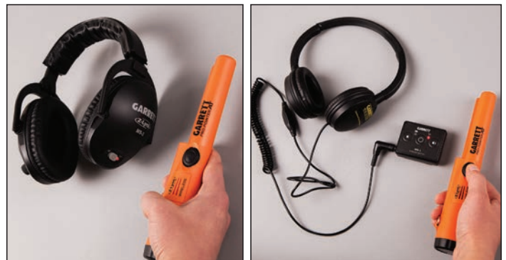
(Above) Simple Pairing to Garrett MS-3 Z-Lynk Wireless Headphones or to any Garrett WR-1 Z-Lynk device. Solid red light on the MS-3 Wireless Headphones or WR-1 Z-Lynk receiver indicates proper pairing with the pinpointer.

The Garrett Pro-Pointer AT Z-Lynk is manufactured in the United States of America and in accordance with Garrett's ISO 9001 internationally certified Quality Management System and meets the following international standards: