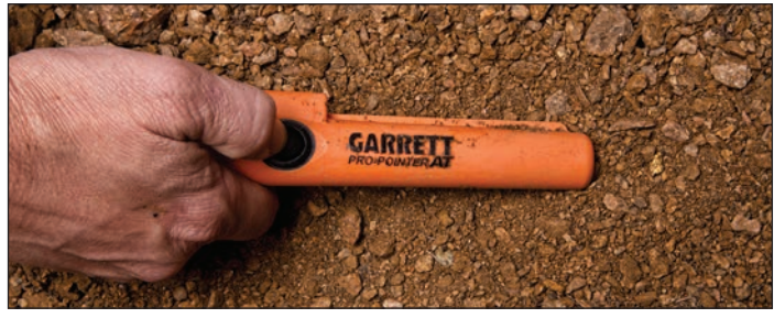
(Above) Fast retune feature quickly tunes out mineralized ground, salt, and other challenging environments.