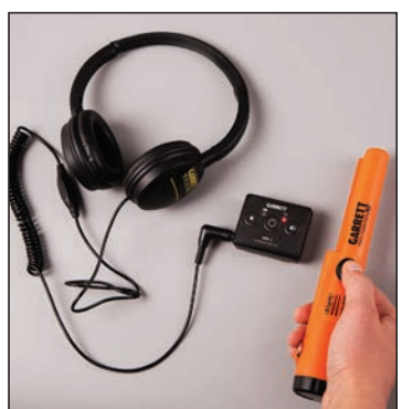
(Above) Simple Pairing to Garrett MS-3 Z-Lynk Wireless Headphones or to any Garrett WR-1 Z-Lynk device. Solid red light on the MS-3 Wireless Headphones or WR-1 Z-Lynk receiver indicates proper pairing with the pinpointer.

The Garrett Pro-Pointer AT Z-Lynk is manufactured in the United States of America and in accordance with Garrett's ISO 9001 internationally certified Quality Management System and meets the following international standards: