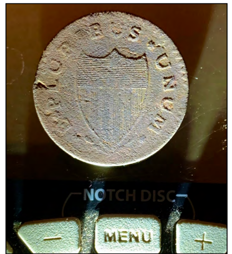
Finder: Bill E., New Hampshire Using: ACE Apex Find: 1788 New Jersey colonial copper coin