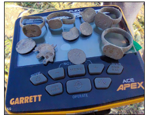
Finder: Andrei B., Europe Using: ACE Apex Find: 14th century Ottoman coins and rings