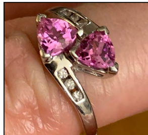
Finder: Ty H., Illinois Using: ACE 200 Find: 14k gold pink tourmaline and diamond ring