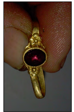
Finder: Patryk S., Europe Using: AT Pro International Find: Small antique gold ring