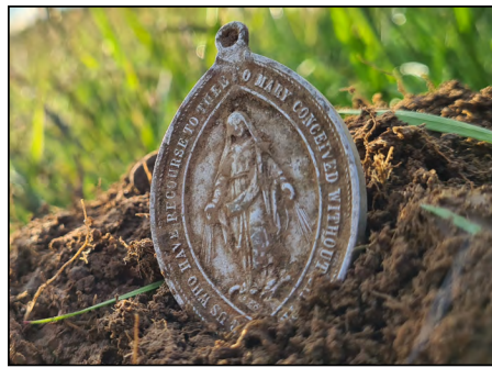
Finder: Craig K., Europe Using: ACE 250 Find: Silver Virgin Mary religious medallion