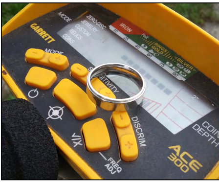
Finder: Jacob G., Michigan Using: ACE 300 Find: Men's stainless steel wedding ring