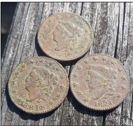
Finder: Heriberto C., Connecticut Using: AT Gold Find: Three early 1800s large cents