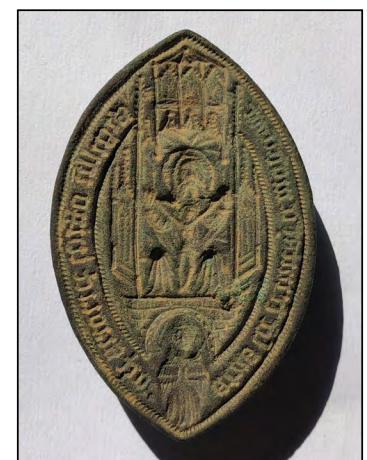
Finder: Matthew C., Europe Using: AT Pro International Find: Significant vesica shaped Priory seal matrix