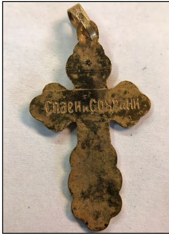
Finder: Bill W., Using: ACE 300 Find: Gold plated Russian Orthodox cross