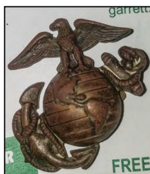
Finder: Ralph D., Tennessee Using: ACE Apex Find: U.S.M.C. pin