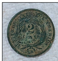
Finder: Ron R., Vermont Using: AT Pro Find: 1866 copper two cent piece