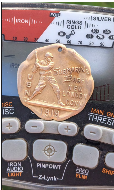
Finder: Todd C., Ohio Using: AT Max Find: 1919 U.S. Navy 10k gold baseball medallion