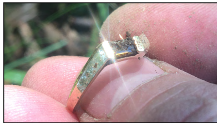
Finder: Ken C., Massachusetts Using: ACE Apex Find: 14k gold ring with emerald cut yellow diamond