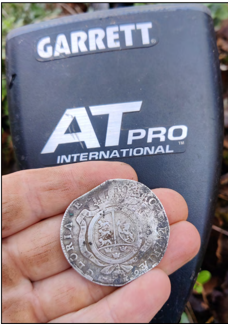
Finder: Jan L., Europe Using: AT Pro Find: 1769 silver Danmark, 1 speciedaler coin