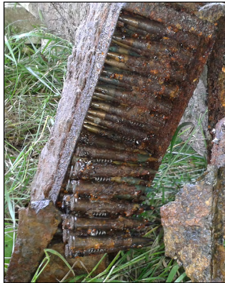
Finder: Henk B., Europe Using: EuroACE Find: Box full of WWII bullets