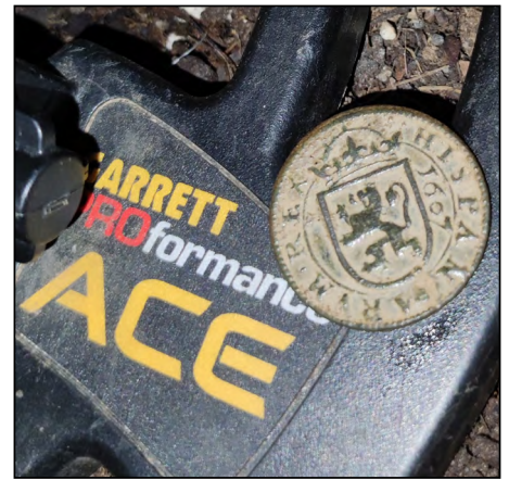
Finder: Francisco R., Europe Using: ACE 250 Find: 1607 Philip III Spanish bronze 4 maravedís coin